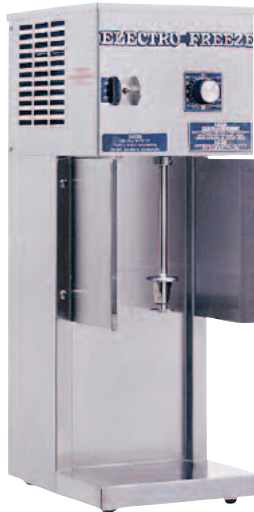
Model HDM 75A

Sound deadening insulation covers the inside walls of the top of the mixer where the motor is located. Also, the base is foamed to help reduce noise.